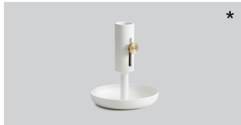
Granny low white – Item no. 808