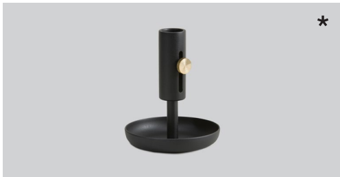
Granny low black – Item no. 806