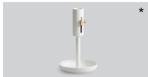
Granny high white – Item no. 809

Design: Rudi Wulff Year: 2015 Type: Candle holder series